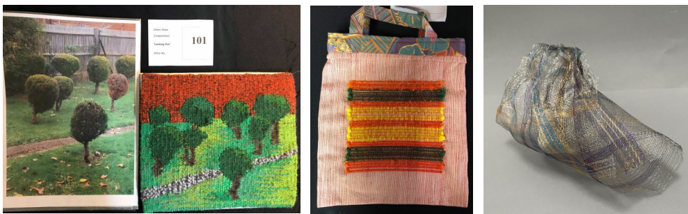
A selection of entries to the Christmas competitions

The London Guild held their first whole Guild in-person meeting since February 2020 on 11 December 2021. At the meeting members presented their submissions for the Christmas competitions of Weaving, Spinning and Design and prizes were awarded. 32 members attended which was good, given the current situation and the fact that most have to use public transport to access the meeting. Members took lateral flow tests before coming and followed all the guidance in place at the time to ensure the meeting took place in as safe a way as possible. The Guild's spinners have met in person fortnightly in a smaller group since restrictions were relaxed, and also demonstrated at Kentish Town City Farm in October.