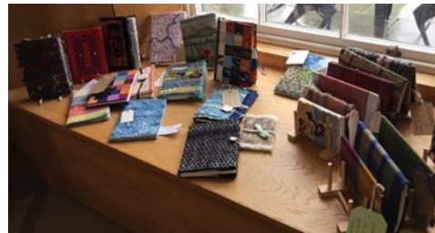
A selection of notebook covers