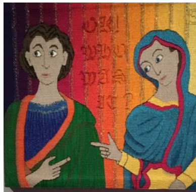
Dot Seddon "Okay who was it?" - a personal battle'